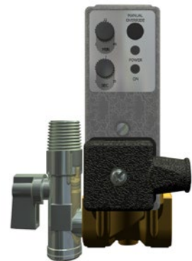
Adjustable Timed Electric Drain