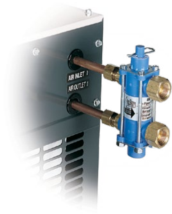
Air Bypass Valve