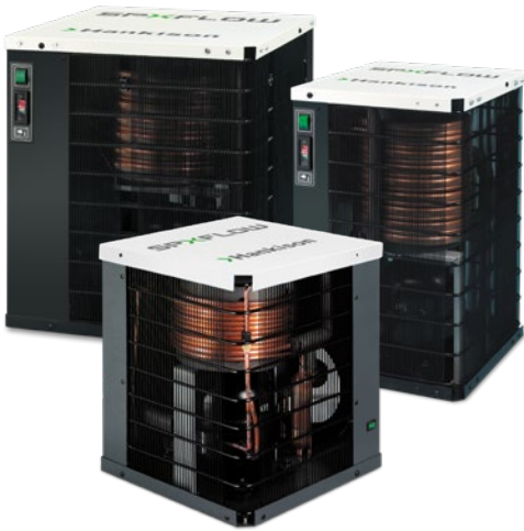
Efficient Smooth Copper Heat Exchangers

Customers around the world have relied on Hankison for great value in air treatment solutions. Hankison Value Line Refrigerated Dryers offer a simple solution based on a long history of industry leading technology.