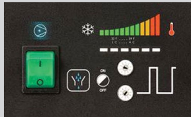
Controls: Models 200-400 scfm