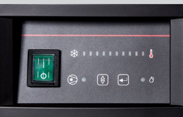
Controls: Models 200-1200 scfm