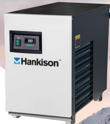
Model Shown Above: HPRN75