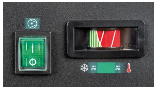
Controls: Models 75 - 150 scfm