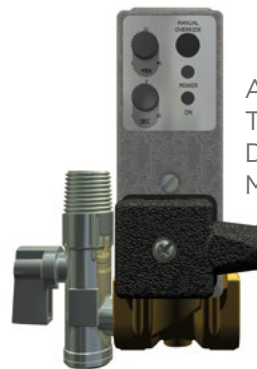
Adjustable Timed Electric Drain for HPRN Models 75 - 150 scfm