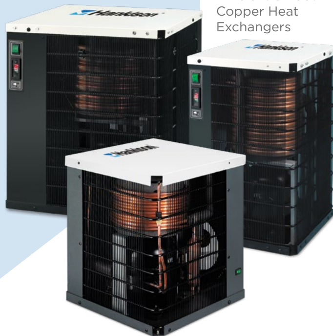
Efficient Smooth Copper Heat Exchangers

Customers around the world have relied on Hankison for great value in air treatment solutions. Hankison Refrigerated Dryers offer a simple solution based on a long history of industry leading technology.