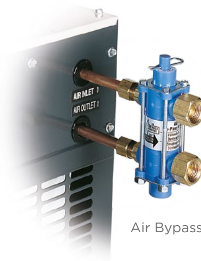
Air Bypass Valve